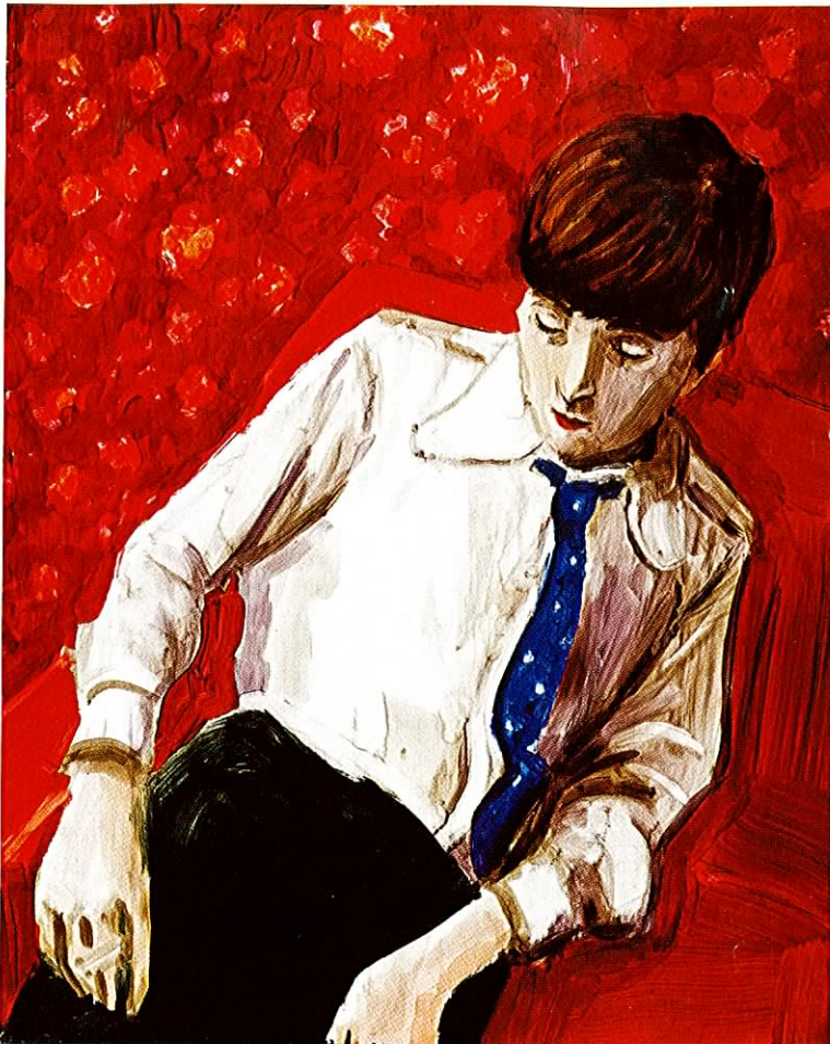
The Red Album —"John Lennon 1965 (Hotel)" (17.1 in. by 14.2 in.) by Elizabeth Peyton, sold for $594,843 at Christie's Post-War and Contemporary Art Sale in London on June 25, 2013, p. 4.